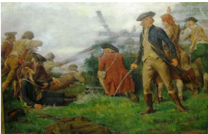
Bunker Hill: Fight at the Rail Fence

As of April 1, a total of 33 of our 45 John Ward Dunsmore paintings have been identified as needing conservation treatment. To date, 22 have been sponsored and conserved. However, there are still 11 paintings that need treatment, a financial commitment of approximately $40,000. See our website for more details.